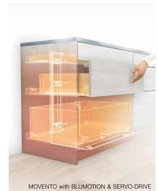
MOVENTO with BLUMOTION & SERVO-DRIVE

NB: TIP-ON cannot be used in combination with BLUMOTION soft close